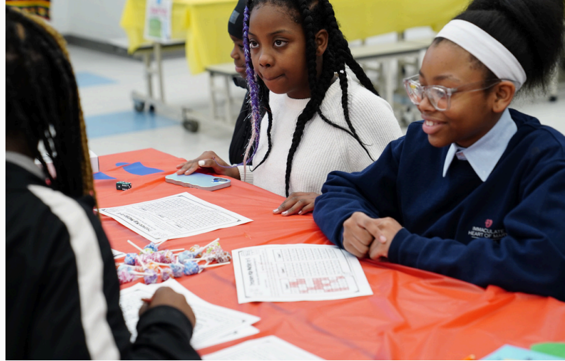
Students enjoying Math & Literacy Night games.