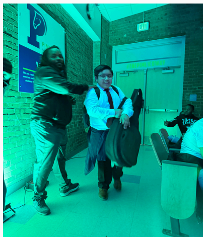
The Talent Show for PBIS Q3 was a huge hit and showcased the wonderful talents of our students.

PBIS: Quarter 4: We will host Rocky's Quarterly Challenge Assembly on April 17. In June, we will host a Field day and Fashion Show for students who earn prize cycles for Quarter 4. Rocky's Talent Show and Carnivals were big hits for Quarter 3, pictured below. Keep up the good work, Stallions!