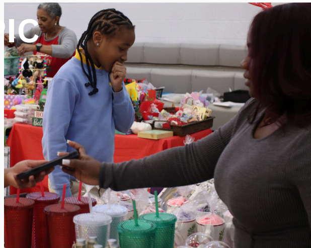
Shopping at the Holiday Bazaar.

The holiday fun continues in January with the 7 th Grade team's student New Year's Resolutions.