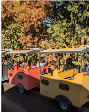
Pumpkin Farm Fun with Pre-First