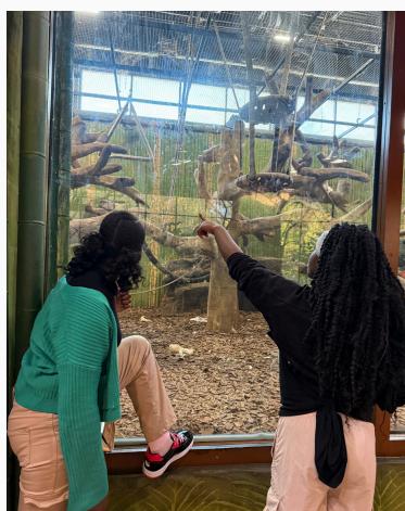
Maryland Zoo with the Middle School